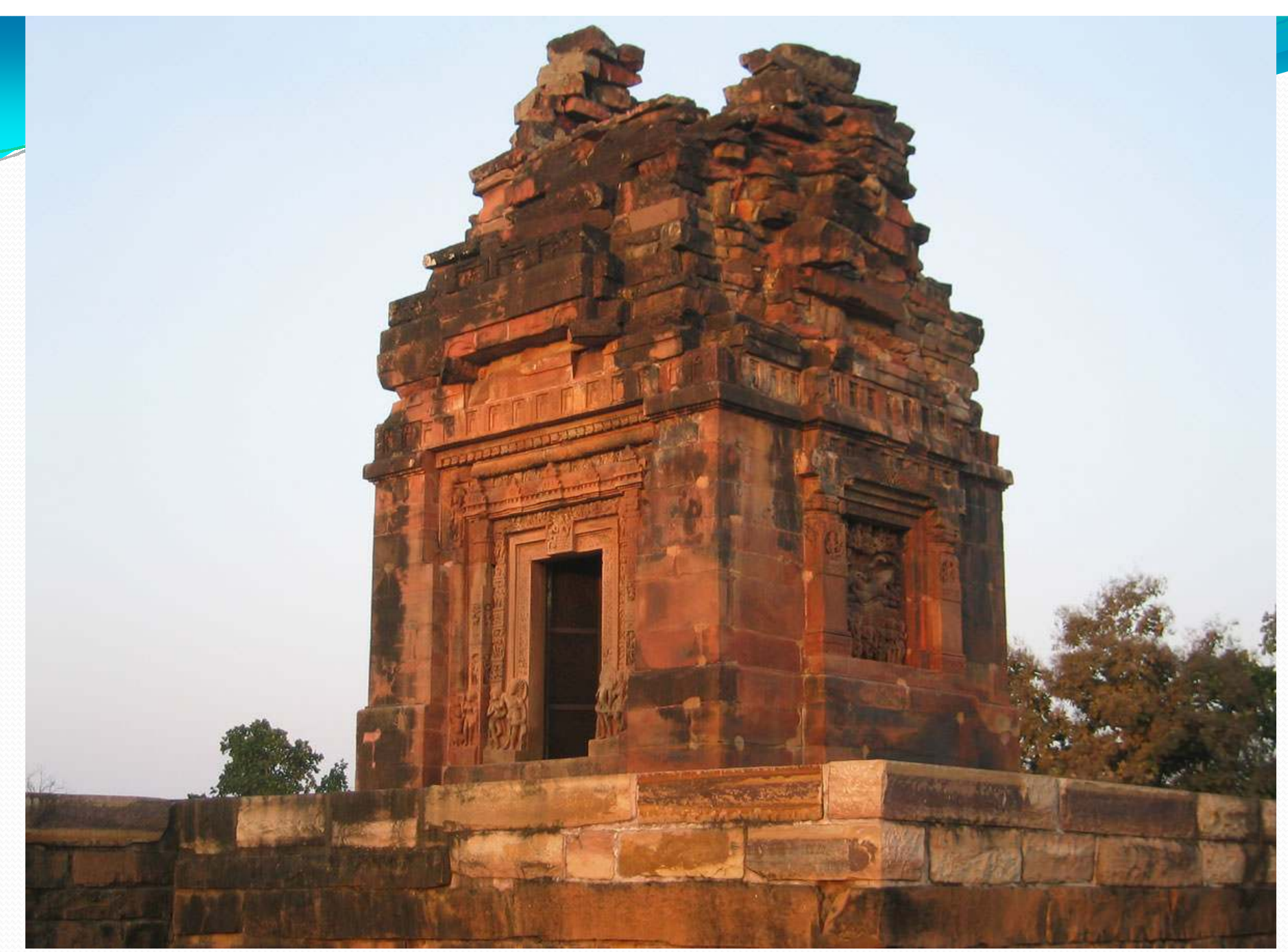
• The Gupta style Dashavatara temple, Deogarh in Madhya Pradesh, India. 5th-6th Century CE.