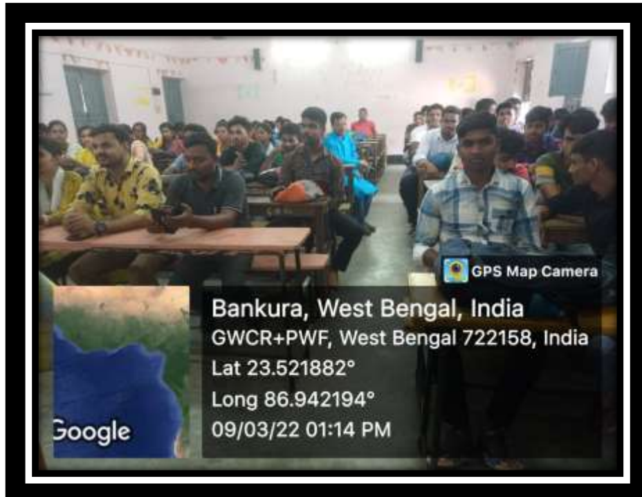
Students present in the Seminar