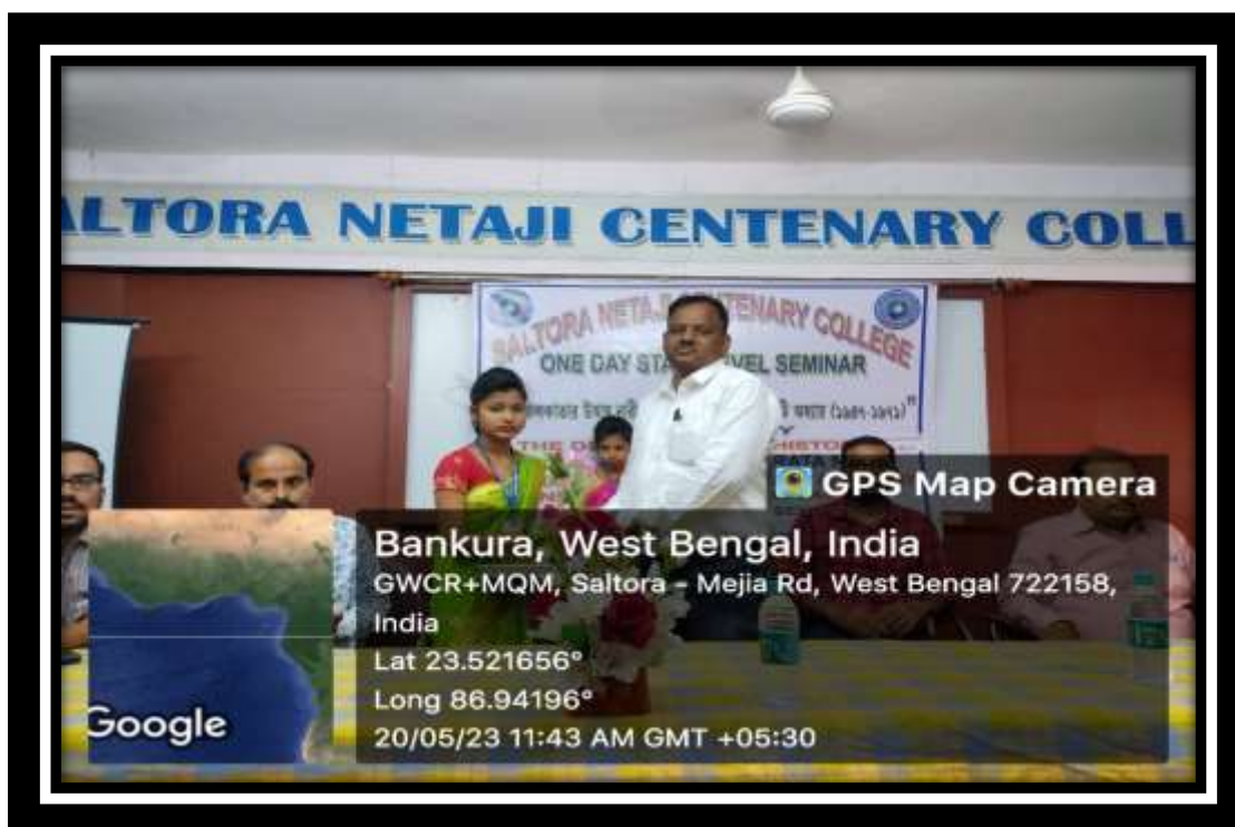
Honourable President of the College receiving the bouquet from a student