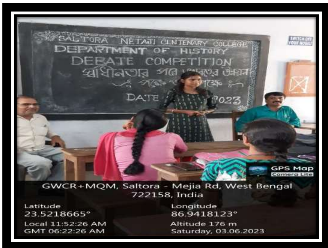
Teachers and Students in the Debates