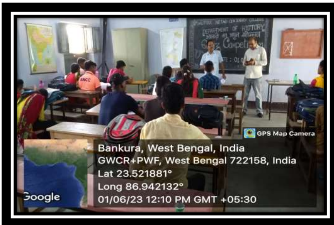
Quiz in progress