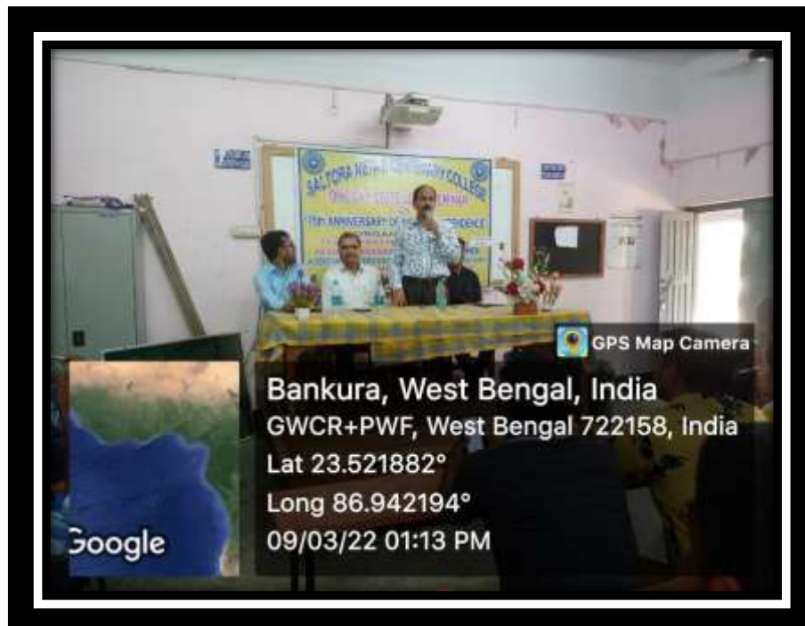
Speech by Principal of the College