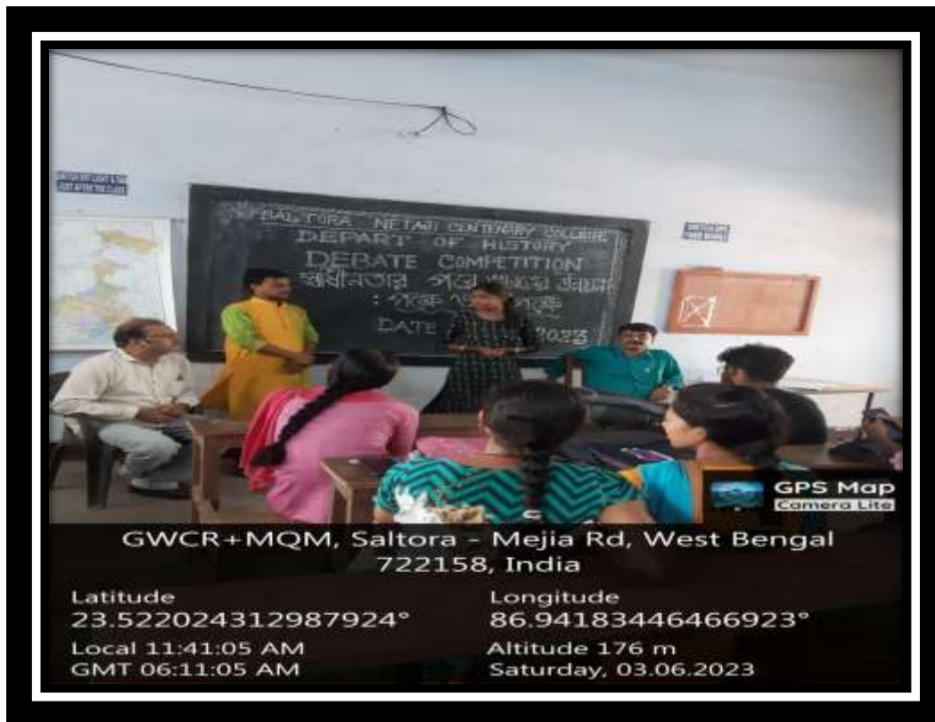
Debate interaction among the students (03.6.2023)