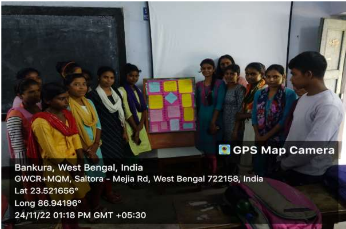
Students with Wall Magazine, “Renaissance” (24.11.2022)